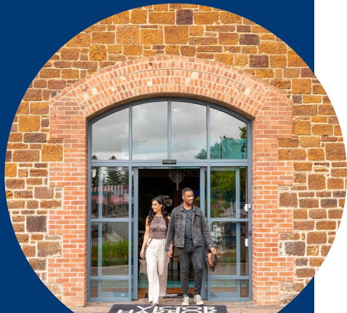
Victor Harbor Visitor Centre