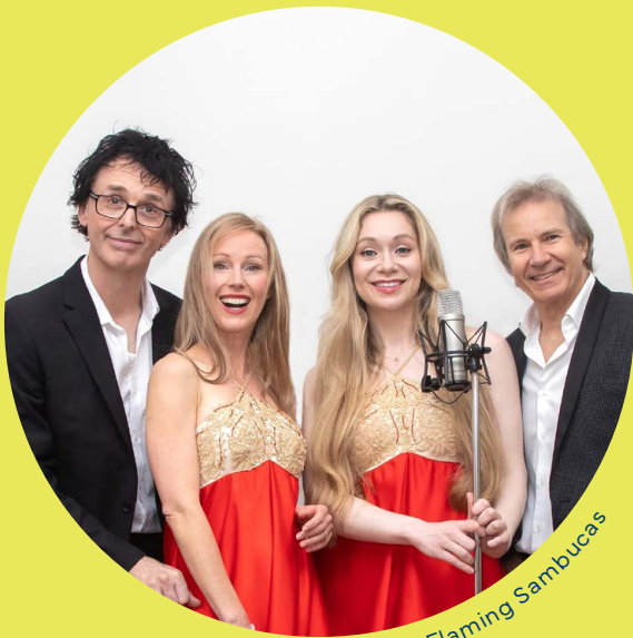
The Flaming Sambucas